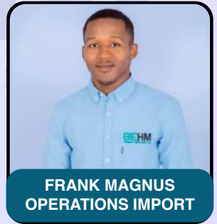
FRANK MAGNUS OPERATIONS IMPORT